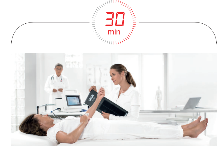
Avoid the "white coat effect" and capture blood pressure accurately with configurable seca EQ BP<sup>™</sup> averaging or sprint mode.