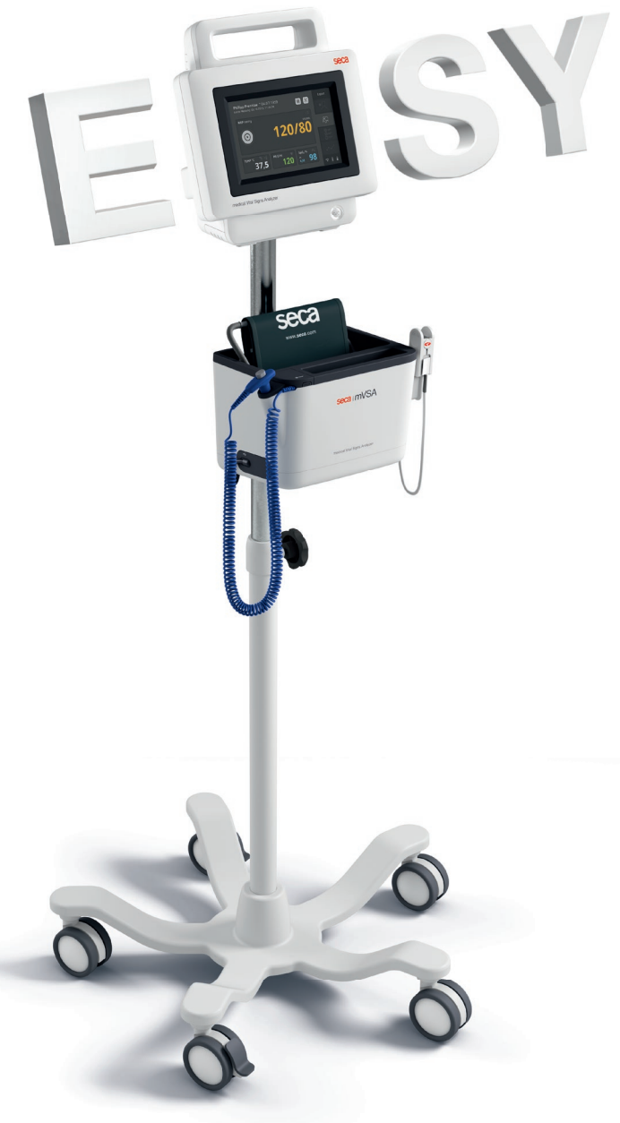
Optional mobile stand seca 475.