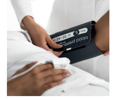
The patient's pulse rate is always measured simultaneously while using blood pressure measurement or pulse oximeter.