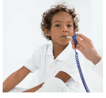
The temperature measurement starts automatically when the probe is used (oral/axillary or rectal).