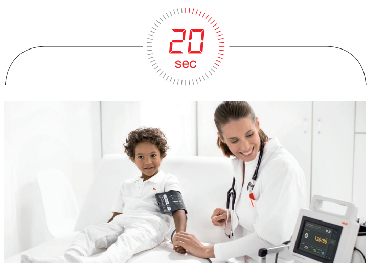
seca EQ BP<sup>™</sup> can be determined quickly and gently using the inflation measurement method.

True screening of hypertension with configurable seca EasyQuick inflation Blood Pressure mode, seca EQ BP<sup>™</sup>: take 6 readings automatically in 30 minutes with the seca EQ BP<sup>™</sup> average mode (BP30), or the average of 3 readings with the seca EQ BP<sup>™</sup> sprint mode. A single reading can be taken in under 20 seconds.