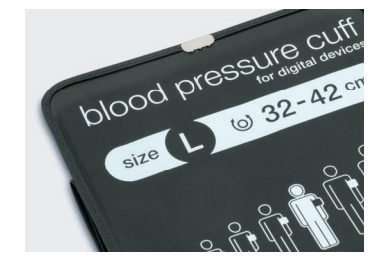
Durable BP cuffs enhanced with metal plate and cuff stitching around the exterior.