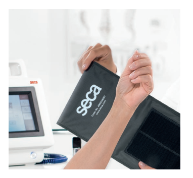
Record blood pressure with the unique inflation or deflation mode with a push of only one button in less than 20 seconds.