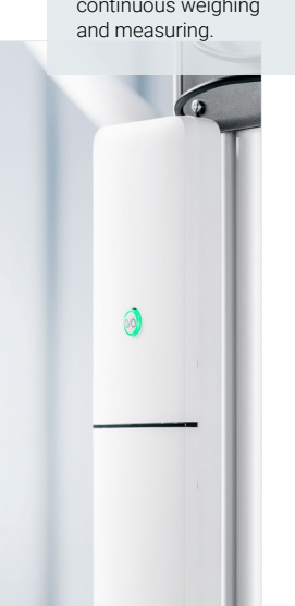
Obtain weight and digital height conveniently at each patient room, bedside, or wherever