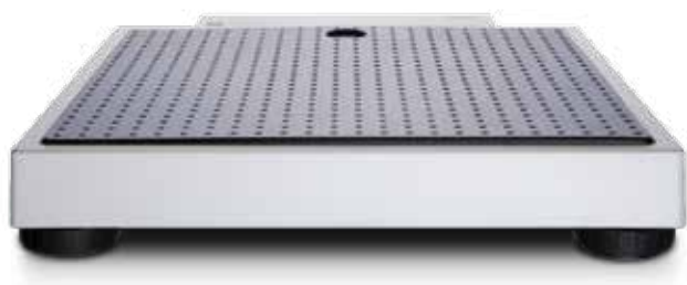
The flat design and slip-proof surface ensure easy access and a secure stance.