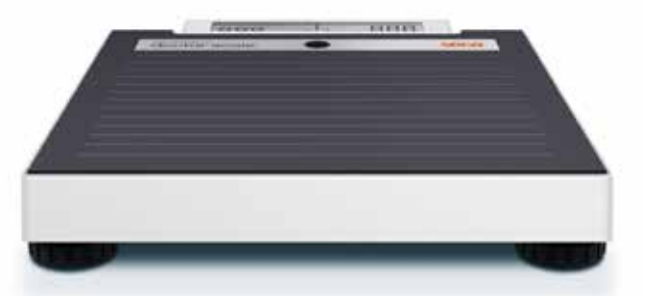
The flat construction and non-slip tread make it stable and comfortable to step onto.