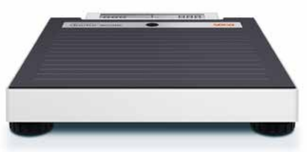
The flat construction and non-slip tread make it stable and comfortable to step onto

The LCD display that is readable from two different directions is the optimal solution for monitoring measured values. The buttons on the front for switching it on and off can be operated by foot and are therefore guaranteed to be easy on the back. It is also possible to weigh infants stress-free using the optional mother/child-function. These features combined with a compact and modern design make the seca 874 dr the ideal doctor scale.