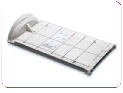
The high-quality folding mechanism guarantees a long service life.