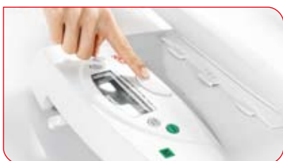
The weighing tray can be removed quickly and easily at the touch of a button.