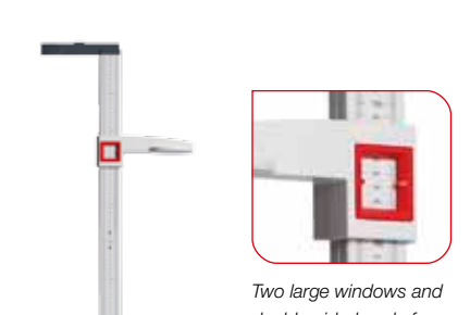
Two large windows and double-sided scale for easy readout.

The measuring rod seca 213 which can be dismantled into several pieces can be set up easily and quickly. It is mounted on the floor plate in no time at all. Further fixation, e.g. by means of a wall fastening, is no longer necessary.