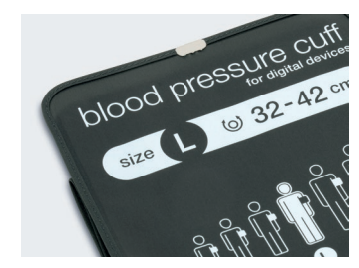
Durable BP cuffs enhanced with metal plate and cuff stitching around the exterior