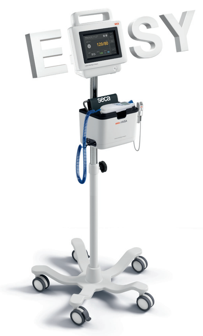
Optional mobile stand seca 475