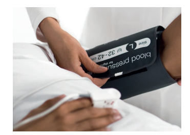
The patient's pulse rate is always measured simultaneously while using blood pressure measurement or pulse oximeter.