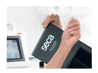
Record blood pressure with the unique inflation or deflation mode with a push of only one button in less than 20 seconds.