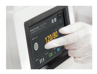
All measurements at a glance on the easy to operate 7" touchscreen monitor.