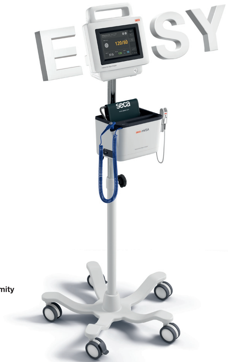
Optional mobile stand seca 475.