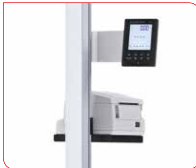
Using the wireless printers seca 466 and seca 465 the measurement results can be immediately printed out or the data can be transmitted directly to an EMR system.