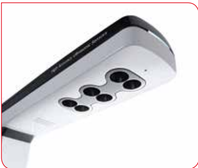
Three unique pairs of sensors transmit and receive ultrasonic signals separately and thereby ensure the most precise measurement results.