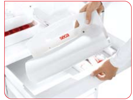
The measuring mat can be rolled up for space-saving storage.