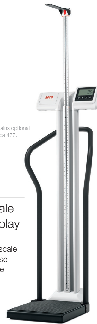
Image contains optional handrail seca 477.