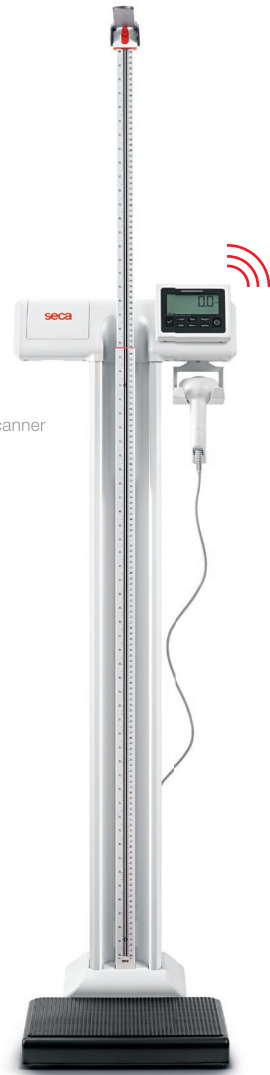
Image contains barcode scanner from a third-party vendor.